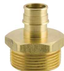
ProPEX Manifold Straight Adapter